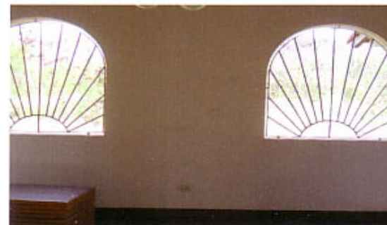
Lot 76B3 with house

YOUR REASONABLE OFFER MAY BE OUR SELLING PRICE.